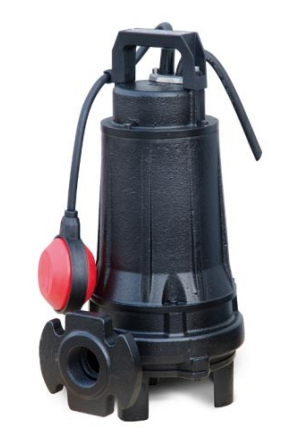
Attention: pictures for illustrative purposes

Tollerance according to ISO 9906:2012 3B2