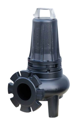
Attention: pictures for illustrative purposes

Tollerance according to ISO 9906:2012 3B2