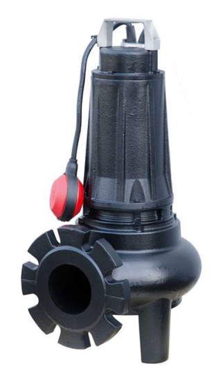
Attention: pictures for illustrative purposes

Tollerance according to ISO 9906:2012 3B2