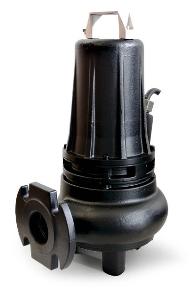
Attention: pictures for illustrative purposes

Tollerance according to ISO 9906:2012 3B2