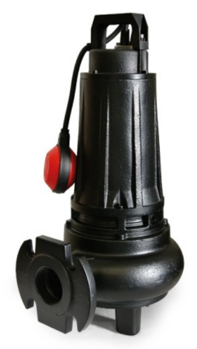
Attention: pictures for illustrative purposes

Installation: Vertical Floating on board machine: vertical not present