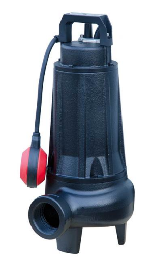
Attention: pictures for illustrative purposes

Tollerance according to ISO 9906:2012 3B2