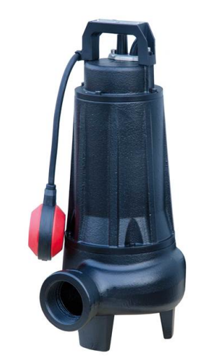
Attention: pictures for illustrative purposes

Tollerance according to ISO 9906:2012 3B2