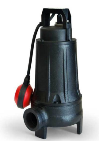
Attention: pictures for illustrative purposes

Tollerance according to ISO 9906:2012 3B2