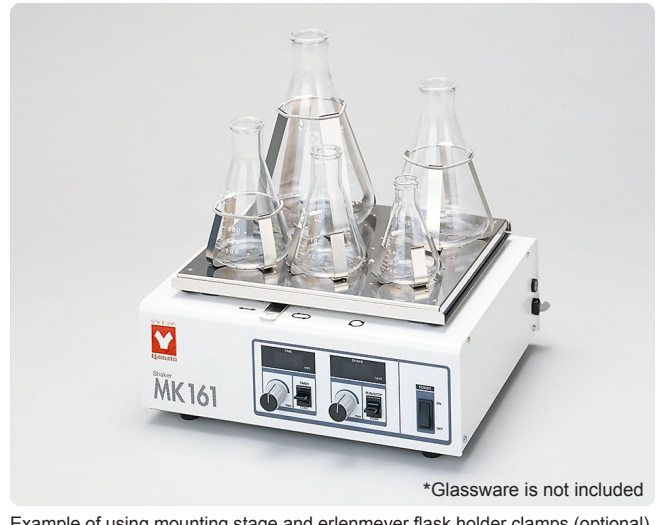
Example of using mounting stage and erlenmeyer flask holder clamps (optional)